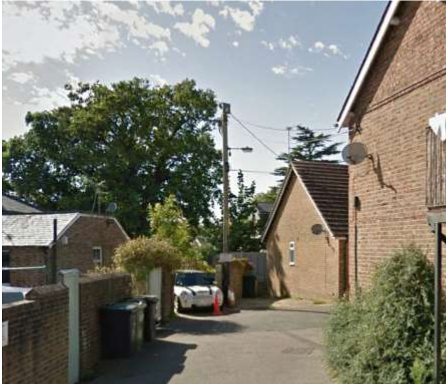
(Current lamp column in situ)