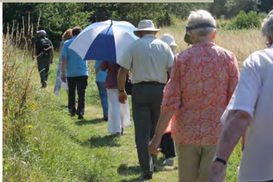
Residents on one of the guided walks